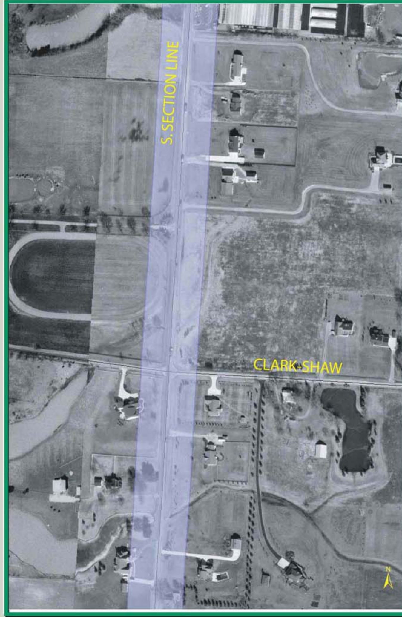
S. Section Line at Clark-Shaw